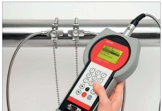
KATflow in operation